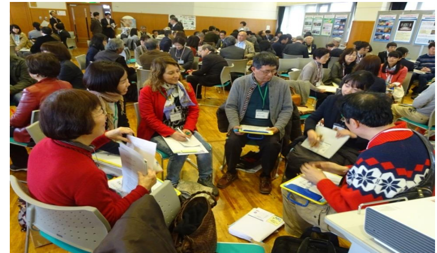
Okayama city: whole city approach for ESD-SDGs